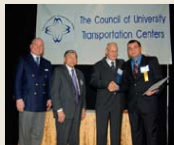
Receiving my SOY Award

I was invited to an awards celebration hosted by the Council of University Transportation Centers (CUTC) held just before TRB. The program included a reception and banquet, a keynote video speech by California Senator Barbara Boxer, and presentation of the SOY awards. At the event, I was able to network with fellow SOYs from UTCs across the country as well as professionals from all areas of the industry and academia. The biggest thrill of the evening for me was shaking the hand of former US Secretary of Transportation Norm Mineta. I was also fortunate to have my parents accompany me to the awards celebration. My mom snapped the photo on page 1 of me with Mr. Mineta.