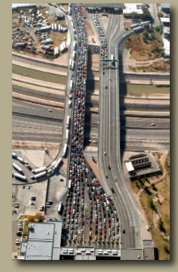
This view of the Bridge of the cally long queues of passenger and commercial vehicles entering the U.S. from Mexico.

The team then assembled a comprehensive archive of border crossing data, including passenger and commercial vehicle