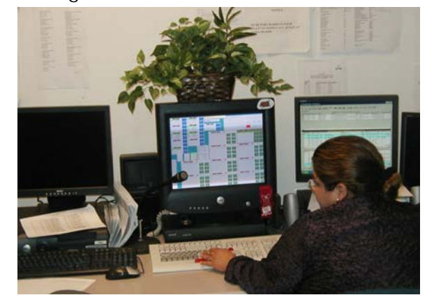
Demand Response Dispatch Control Center

productivity is defined as the number of passenger trips per hour or mile that revenue vehicles handle ("revenue vehicle hour" or "revenue vehicle mile"). Passenger trips per