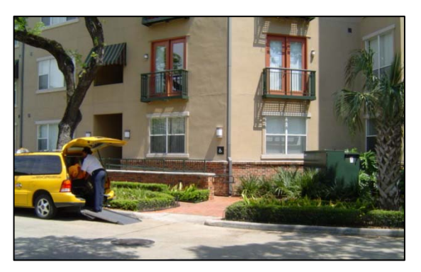
Curb-to-Curb Service – Patron Meets Vehicle at the Curb

Door-to-door service provides patrons with driver assistance from the exit door of origin to the vehicle. It also provides patrons with assistance from the vehicle to the entrance door of the destination.