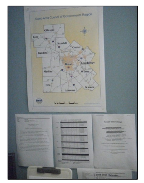
Dispatch Office Posted Information

Staffing in dispatch can affect the productivity of the overall system. If patrons cannot get through to dispatch to cancel a trip, check on a driver, or let the dispatcher know the driver is late, the entire schedule for the day can be