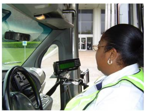
Driver Viewing Mobile Data Computer