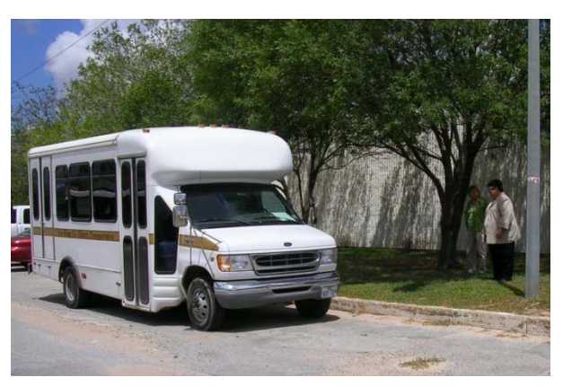
Patrons Awaiting Demand Response Vehicle

specified window of time such as 15 minutes in advance of a scheduled pick-up time. "The pick-up window is the time before and after a trip is scheduled that a passenger is expected to be ready to travel. Most agencies use some type of pick-up window to give schedulers and drivers some flexibility in the actual pick-up time and still be considered on time."<sup>15</sup> The pick-up window allows flexibility in the schedule and helps ensure the patron is ready at the scheduled time. The most prevalent pick-up window is 15 minutes before to 15 minutes after the scheduled pick-up time. The most common required wait time reported is five minutes (75.8% of survey respondents).<sup>16</sup>