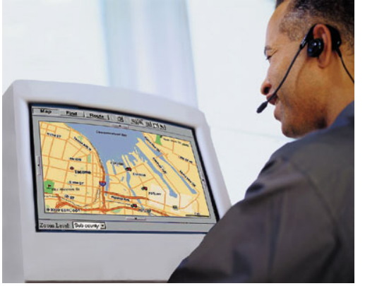
Dispatcher Viewing Automatic Vehicle Locator

With the implementation of MDTs, MDCs and AVLs, there may be an opportunity to free some